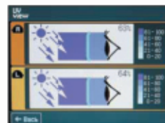
Screen for UV Measurement (3000C only)