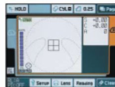
Progressive Mode (Near)

The 5.7 inch color TFT LCD touch panel display provides a clear image with an easy-to-use-customizable shortcut menu.